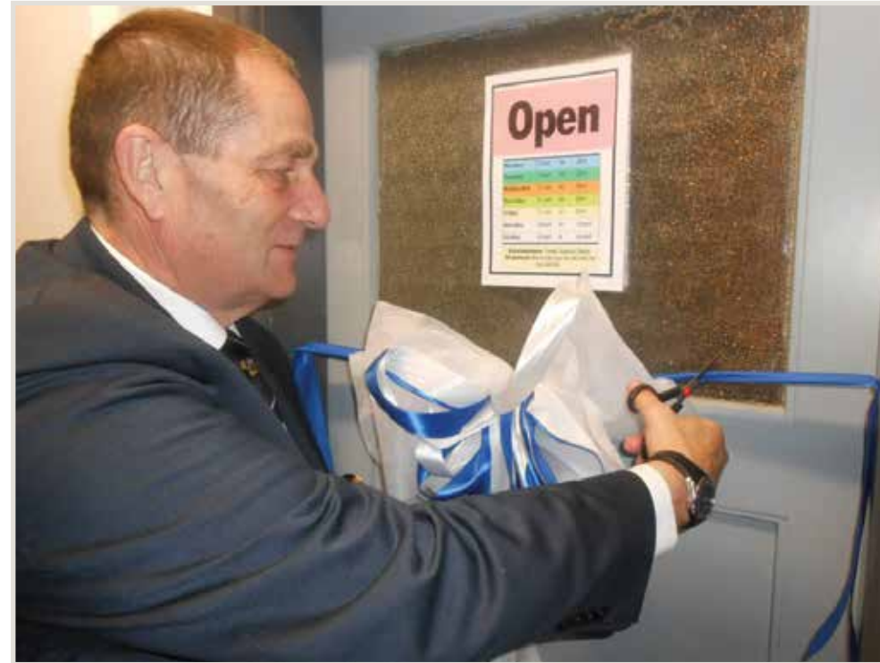
Hon. Chester Burrows MP for Whanganui opening the Whanganui Multicultural Council's office "One Stop Shop" to support migrants and refugees.

Providing services to new migrants is a core function of multicultural councils. A number of local councils are members of the New Zealand Newcomers Network, operate local networks and employ a migrant services or newcomers network co-ordinator. Activities include social lunches, morning teas, potluck dinners, walking groups, pre-school playgroups, marae visits, settlement and employment support and educational activities. A number of councils have received funding from the Office of Ethnic Communities Settling In Fund, which has also made a grant to Multicultural New Zealand towards developing a national network of migrant centres. Multicultural Councils also regularly attend mayoral citizenship ceremonies for migrants taking up New Zealand citizenship.