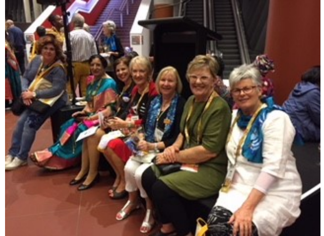
Our ladies with the previous IW President (front) from our area and some new found friends

The ladies are not back yet so we don't have a full report but here are some photos