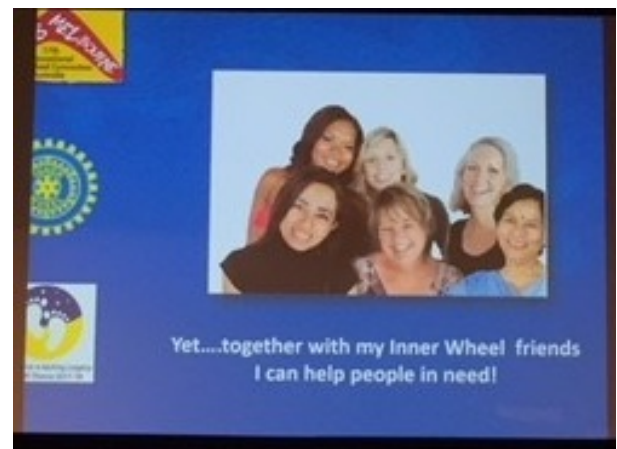
Screen shot from one of the presentations