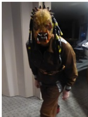
I have nothing to say!!!!