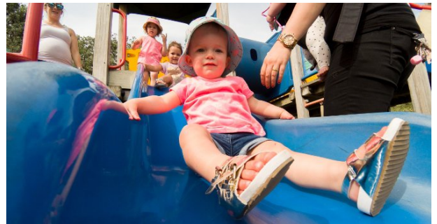
Children in one of Whitby's playgrounds

to hear examples and share experiences for establishing collaborations between stakeholders, researchers, community service and health providers and policy makers. This gives us an opportunity to highlight the work that Inner Wheel and Rotary are doing in the community.